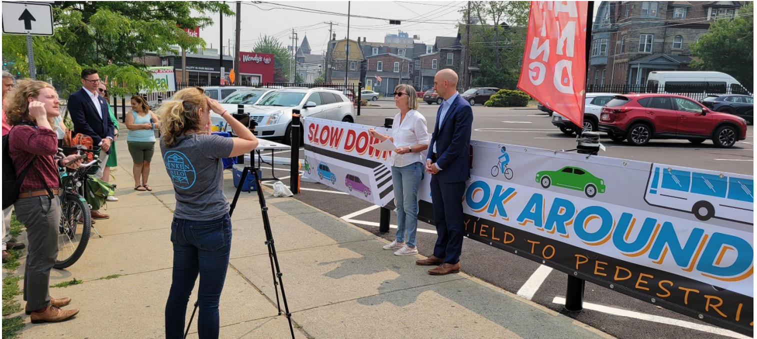
CAT Yield to Pedestrians-Slow Down, Look Around Press Conference, June 2023

CAT helps people use bikes for transportation, which takes cars off the road! Every dollar supporting CAT goes a long way to help the community. Every person who enters the CAT Bicycle Cooperative or who participates in a CAT program is treated with respect, dignity, and the intention of empowerment through knowledge.