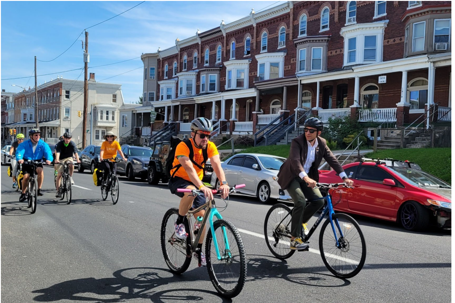
Monthly Mayor's Ride in Allentown, September 2023

CAT—Coalition for Appropriate Transportation works to improve mobility for everyone. Better bicycling, walking/ADA accessibility, and public transit develop a stronger, smarter economy and a higher quality of life. Sustainable transportation reduces traffic congestion, counters climate change, and offer a healthier community for everyone.