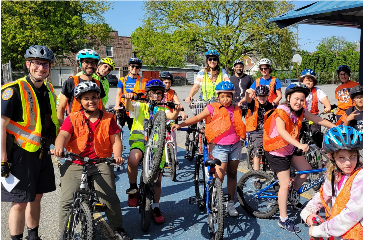
William Penn Bike Club, Spring 2023