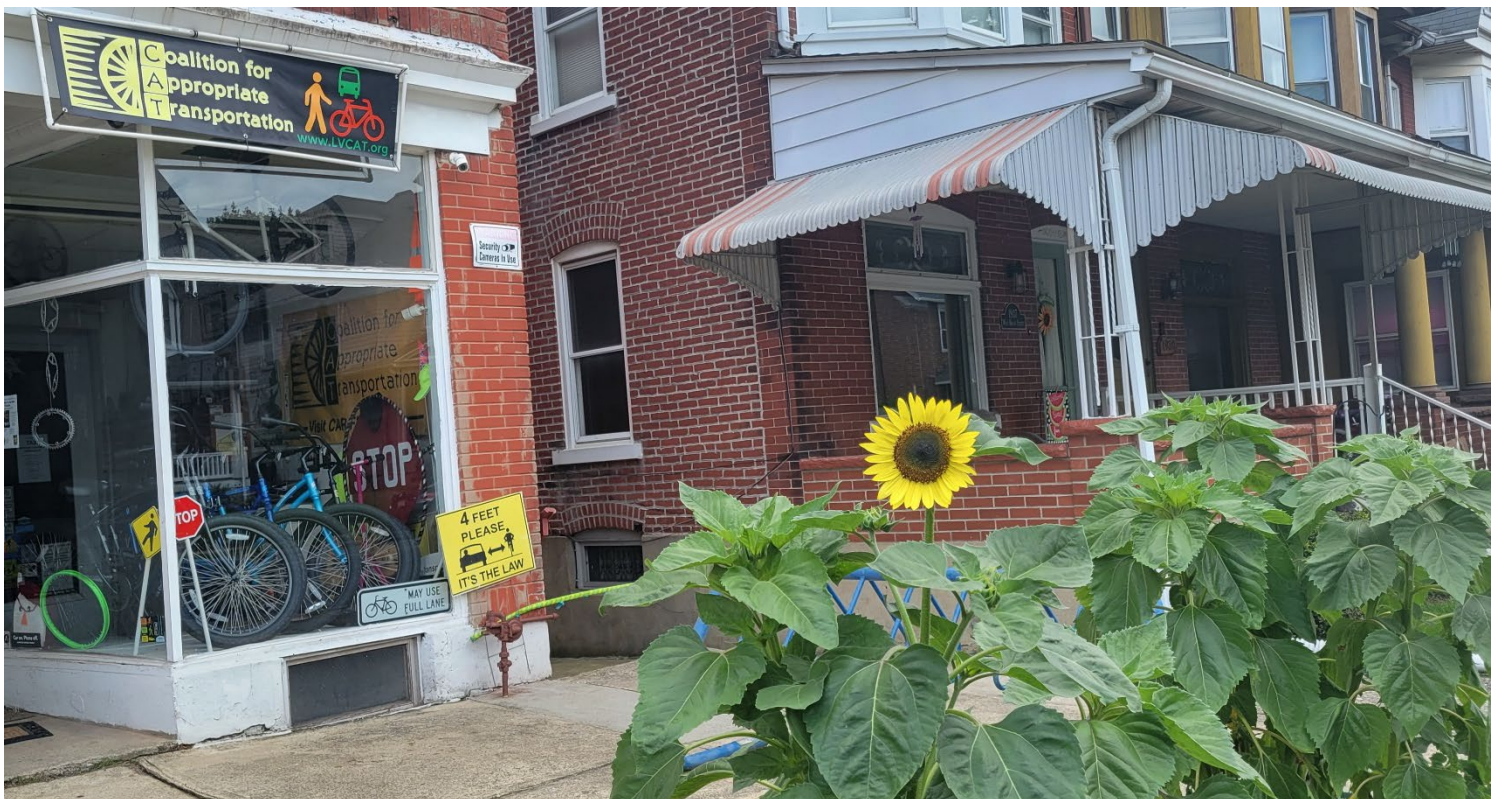
CAT Bicycle Cooperative, Summer 2023