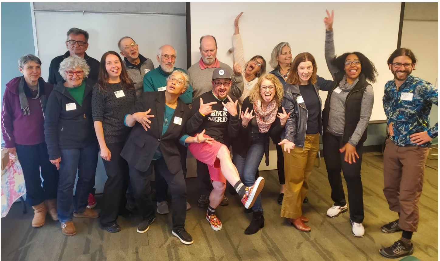
CAT Board of Directors at Annual Meeting 2023