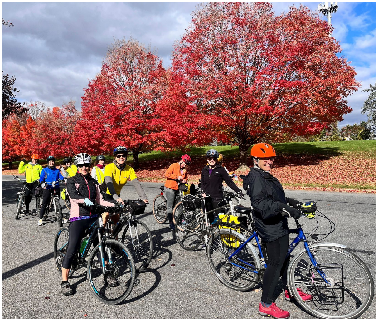
1CAT Bakery Ride, Oct 2023