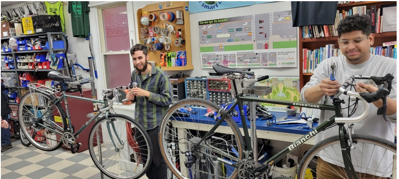
CAT Bicycle Cooperative

Open 4-5 days per week for one-on-one mentorship and volunteering for individuals and families. CAT’s home for activities and community where no experience is needed to become mechanic, volunteer, or repair one’s own bike.