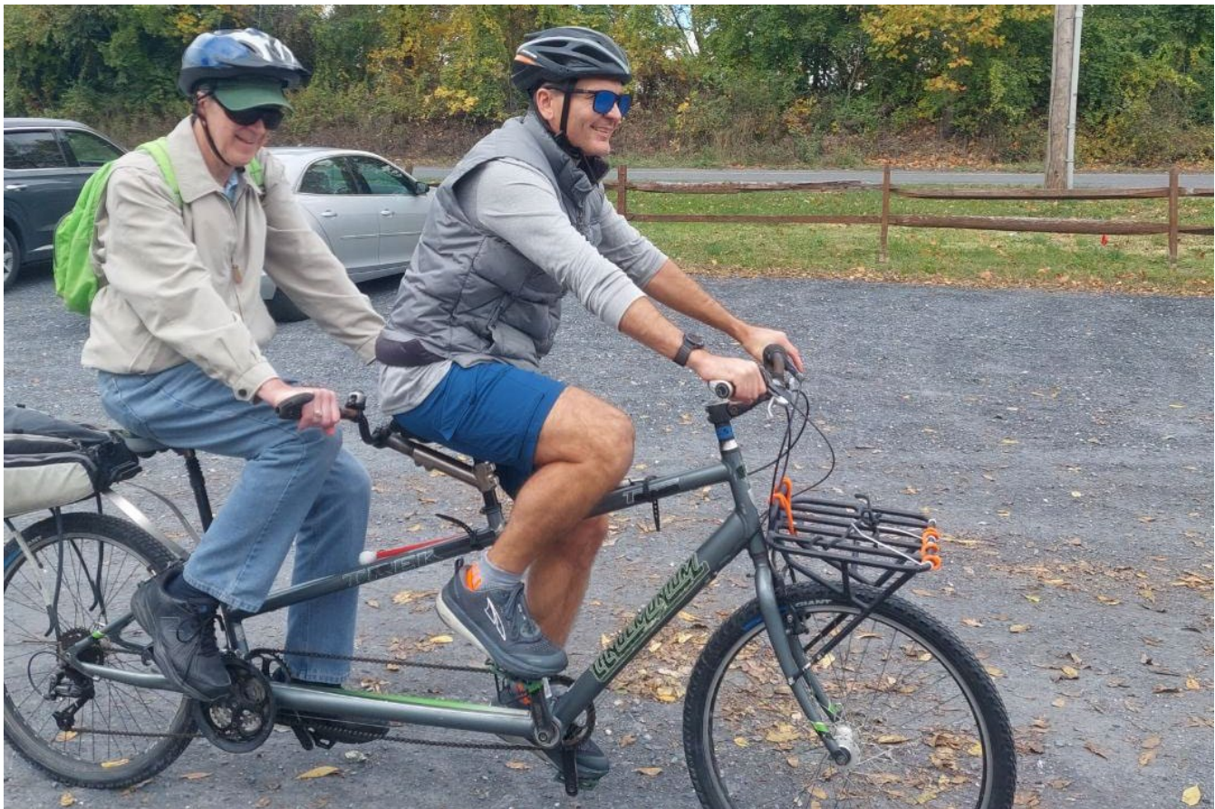
Sights for Hope Ride, April 2023